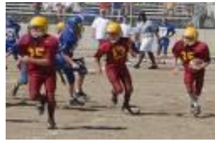
Trona's sand field, "The Pit"