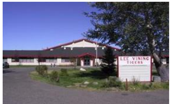
Lee Vining High School