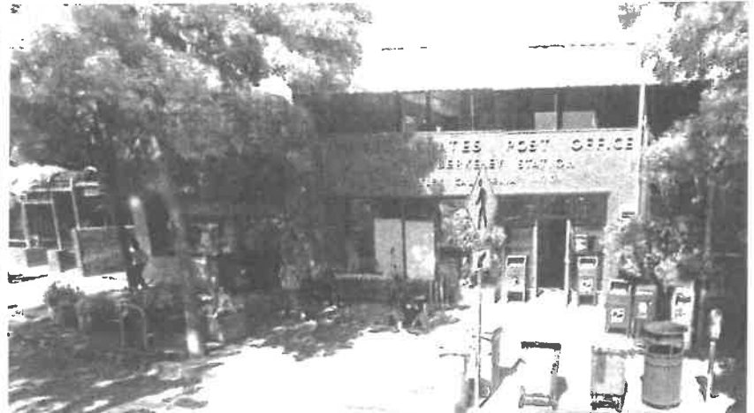
The Home of the C.L.F. and C.I.F.P.F. since August 1, 1954— 1521A Shattuck Avenue, Berkeley