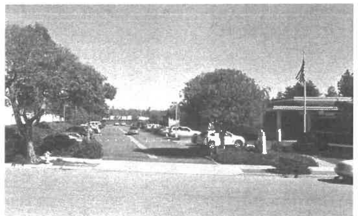
Picture taken at the CIF office in Santa Barbara in 1971.