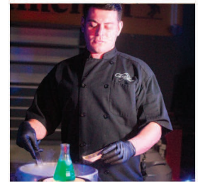
PROMS & EVENTS