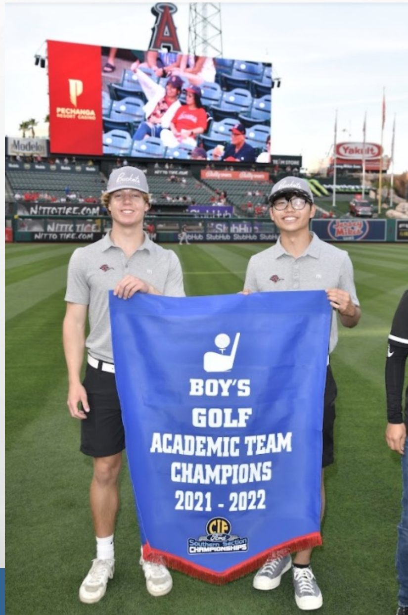
Loma Linda Academy – Boys Golf