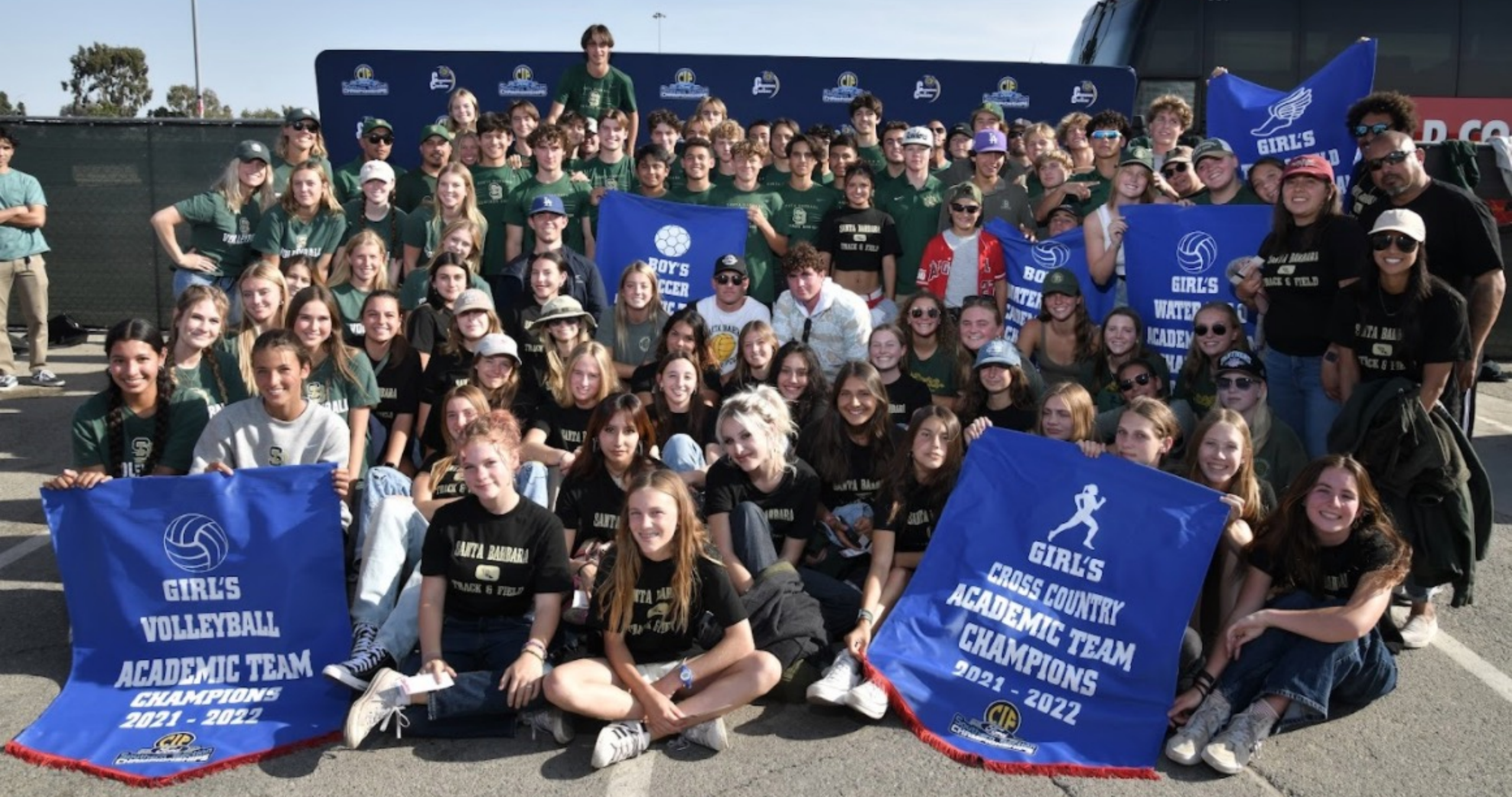
Santa Barbara High School