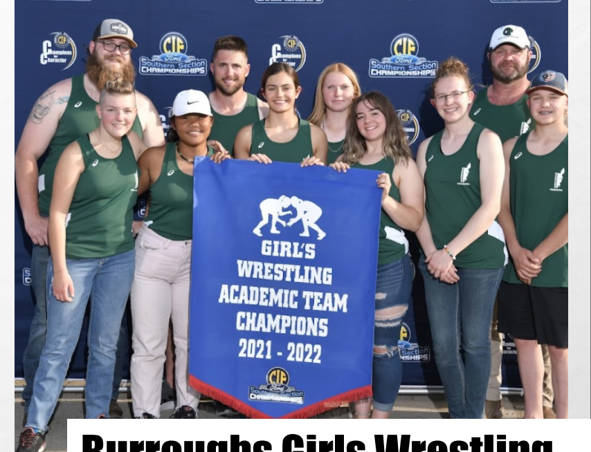
Burroughs Girls Wrestling