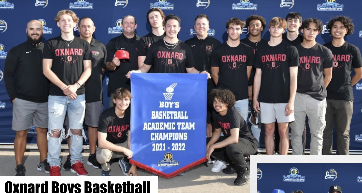
Oxnard Boys Basketball