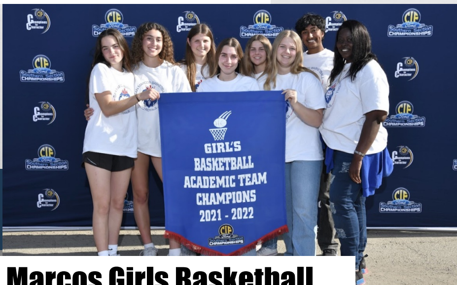
San Marcos Girls Basketball