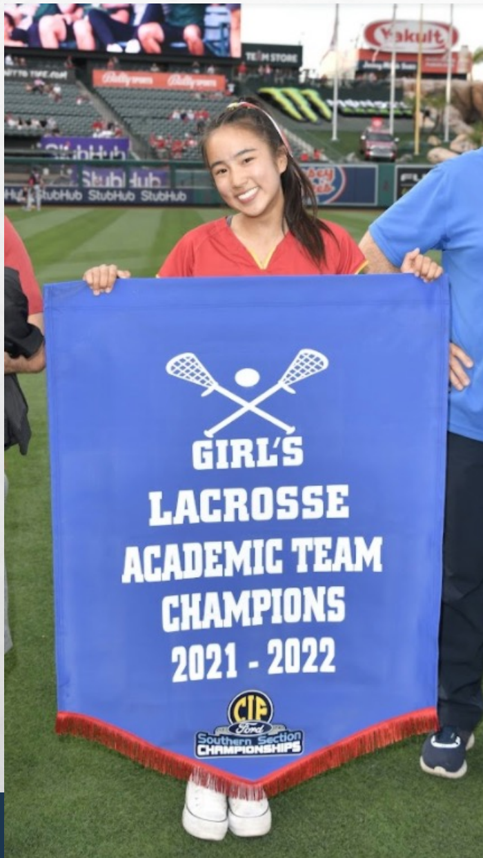
Woodbridge – Girls Lacrosse