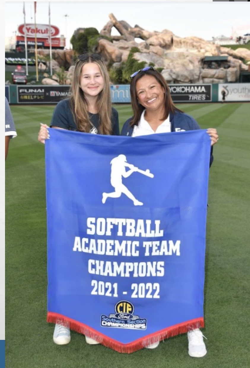
Flintridge Prep – Softball