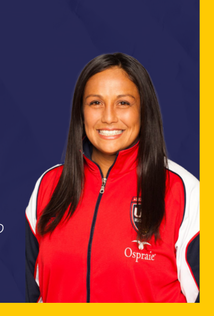
Exhibit Hall C/D

Brenda Villa 4-Time Olympic Medalist - Water Polo Bell Gardens High School