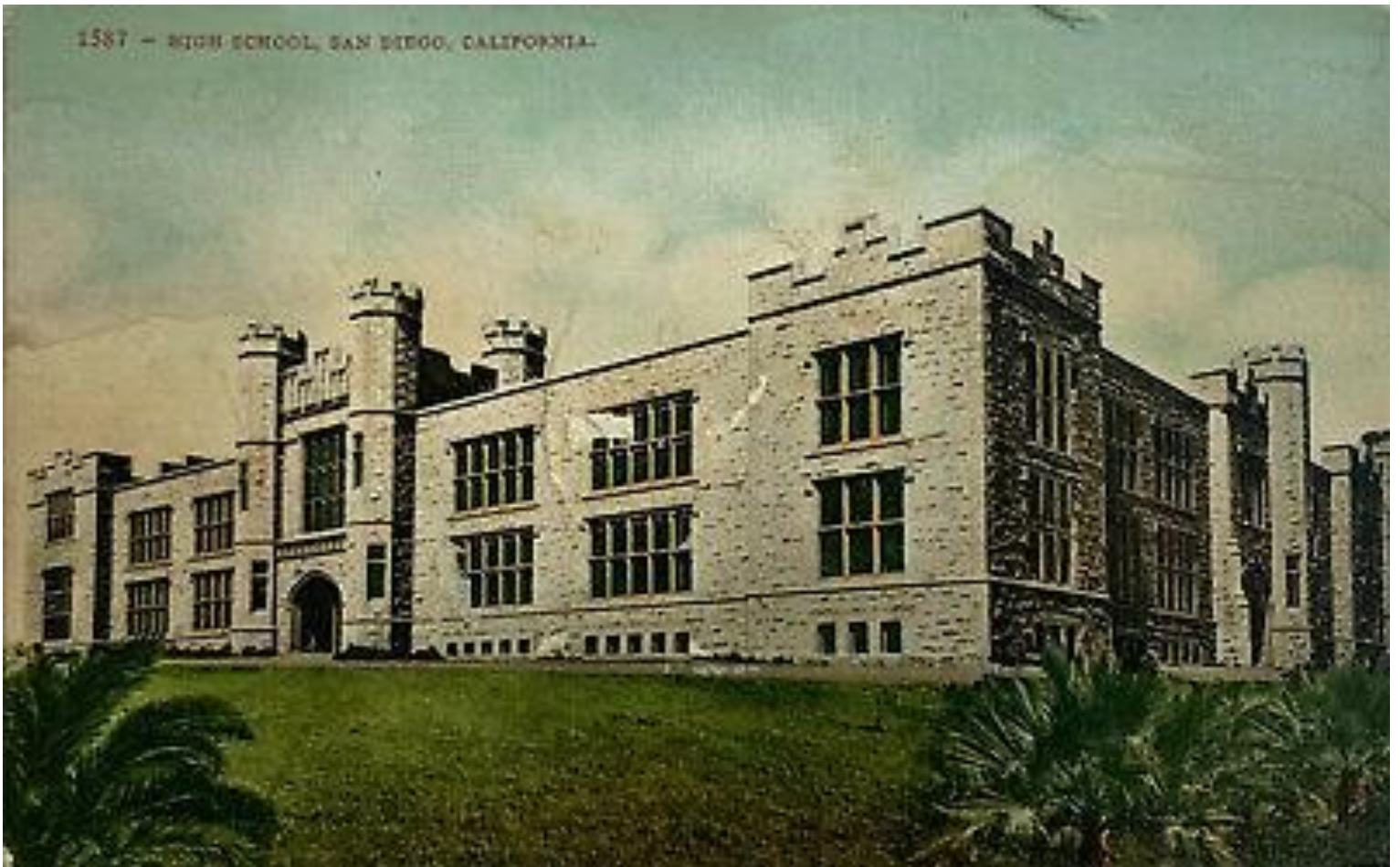
1887 - HIGH SCHOOL, SAN DIEGO, CALIFORNIA