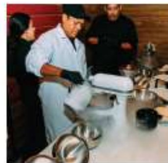
PROMS & EVENTS

SPORTS BANQUETS, PRE & POST GAME MEALS & SCHOOL ACTIVITIES