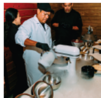
PROMS & EVENTS

SPORTS BANQUETS, PRE & POST GAME MEALS & SCHOOL ACTIVITIES