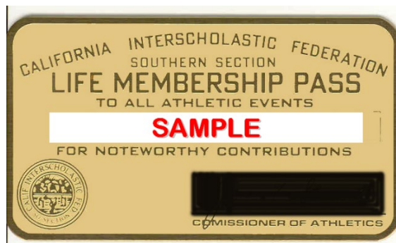
Gold Life Pass

Schools hosting lacrosse playoff games/finals are responsible for the health and welfare of those allowed on their personal property.