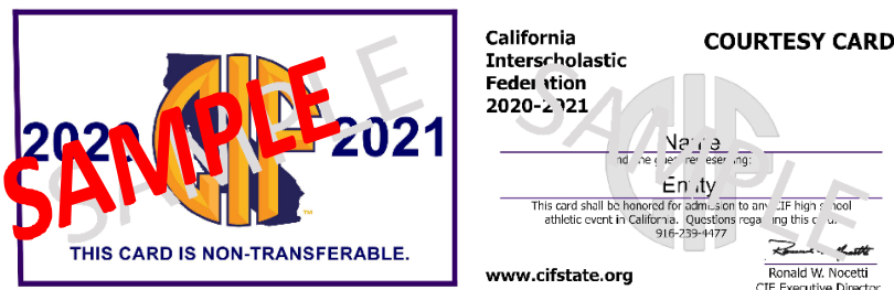
2020-21 State Courtesy Card