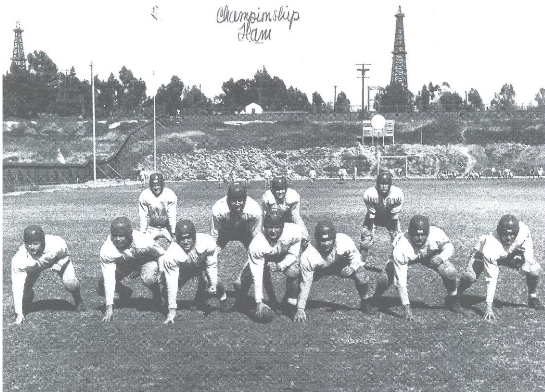
Redondo vs. Santa Monica