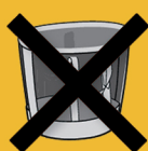
TINTED PLASTIC BAGS