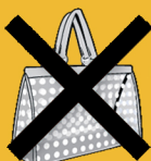
LARGE PRINTED BAGS