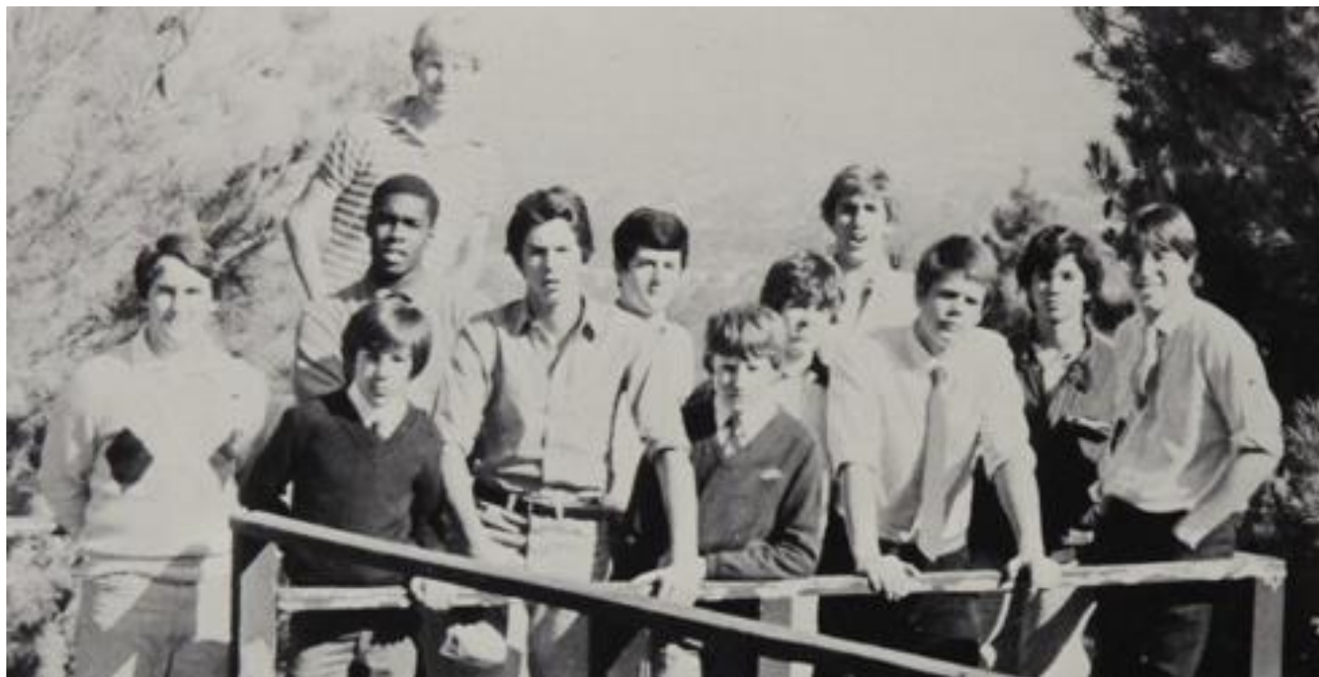
Buckley High School Team (Sherman Oaks) defeated in Semi-Final Round 31 - 16