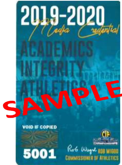
(MEDIA Pass-TEAL BLUE)