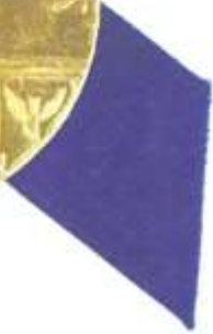
Recorded at HELMS ATHLETIC FOUNDATION December 16, 1944