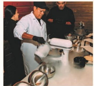
PROMS & EVENTS

SPORTS BANQUETS, PRE & POST GAME MEALS & SCHOOL ACTIVITIES