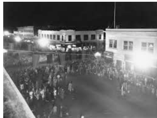
Anaheim Halloween Festival - 1928