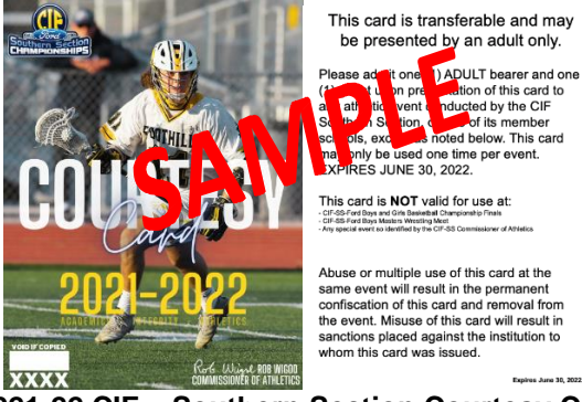
2021-22 CIF - Southern Section Courtesy Card