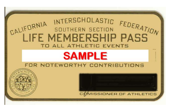
Gold Life Pass