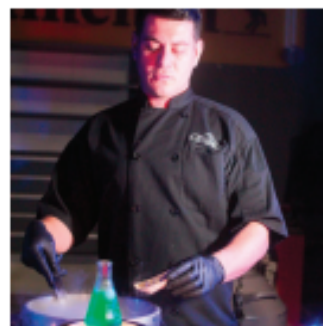
PROMS & EVENTS

SPORTS BANQUETS, PRE & POST GAME MEALS & SCHOOL ACTIVITIES