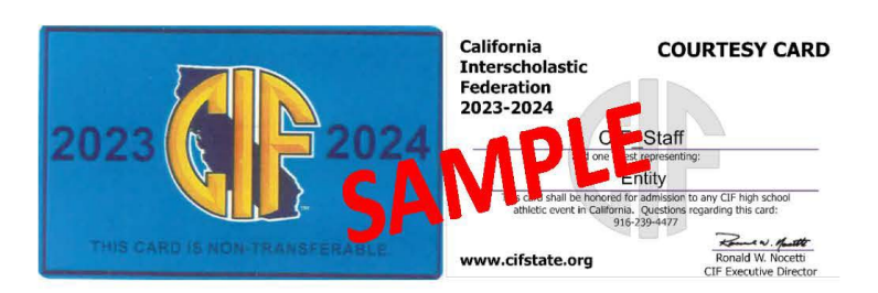
2023-24 State Courtesy Card- Good for bearer + 1

2023-24 CIF-Southern Section Courtesy Card- Good for bearer + 1