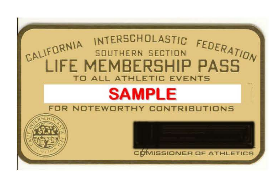
Gold Life Pass - Good for bearer + 1

2023-24 CIF-SS Media Pass (Pass Good Bearer only and for Press OR Photo)