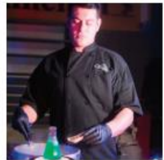
PROMS & EVENTS

SPORTS BANQUETS, PRE & POST GAME MEALS & SCHOOL ACTIVITIES