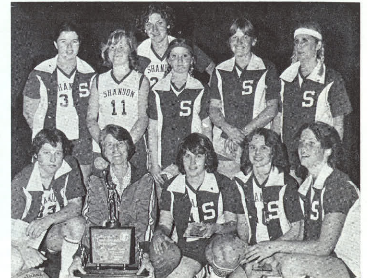
Shandon Small Schools