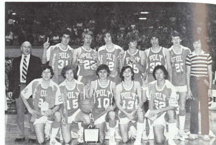
Pasadena Poly Small School