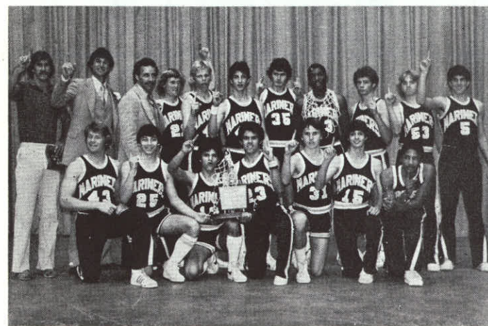
St. Monica 1A