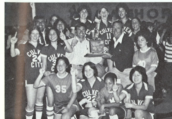
Culver City 1A