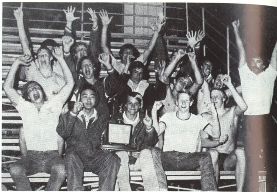
Mission Viejo celebrates fifth consecutive swim title

TEAM SCORES — Newbury Park 142½, Crescenta Valley 101, El Toro 100, El Dorado 93, Crespi 90, Thousand Oaks 80, Los Altos 76, Servite 70, Glendale 65, Irvine 53