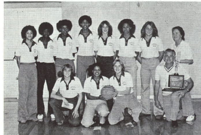
Riverside Poly 3A