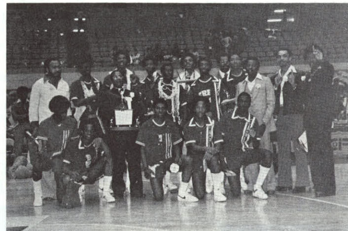
Verbum Dei 4A