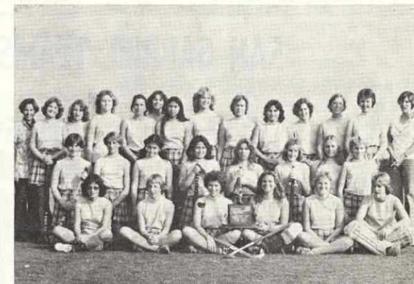
Runner-up La Habra High School