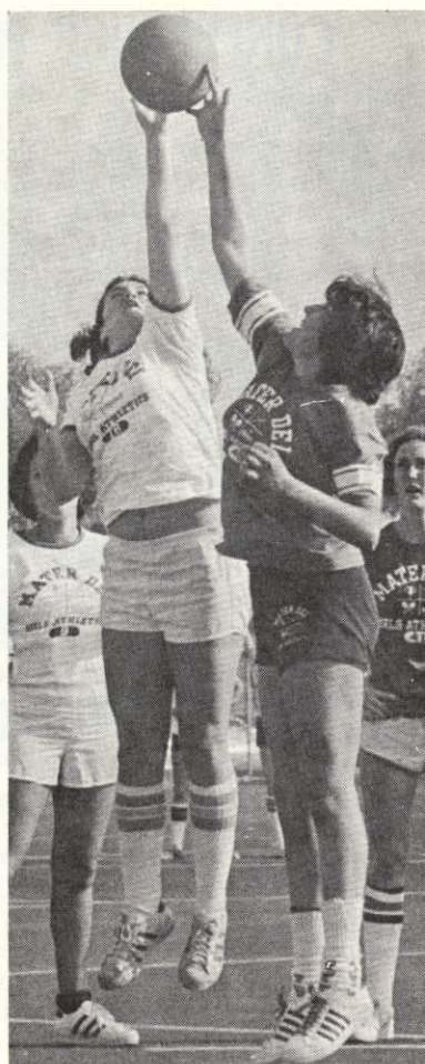
The CIF-SS girl's basketball finals are slated for Friday, April 29 at Cal State Fullerton. The 3A Contest begins at 6:30 a.m. followed by the 4A finals at 8 p.m. The 2A finals are the same date at a neutral site to be announced.