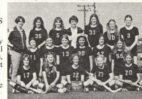
Fourth Place Sonora

Charter Oak placed third in the section over Sonora 1-0.