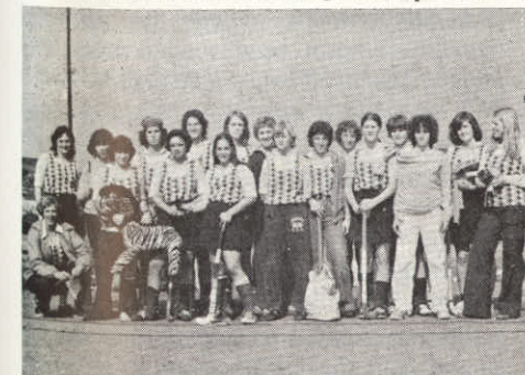
Third Place Charter Oak

Colton emerged No. 1 in CIF-SS field hockey at the Jan. 22 finals.