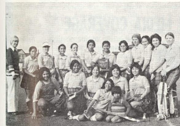
CIF-SS Field Hockey Champs from Colton