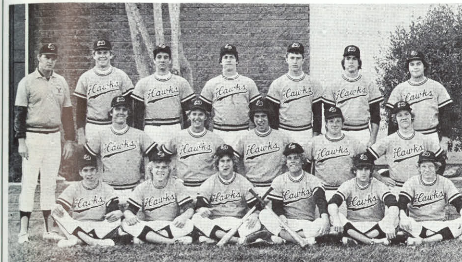
Top honors in 2A division go to El Dorado High School