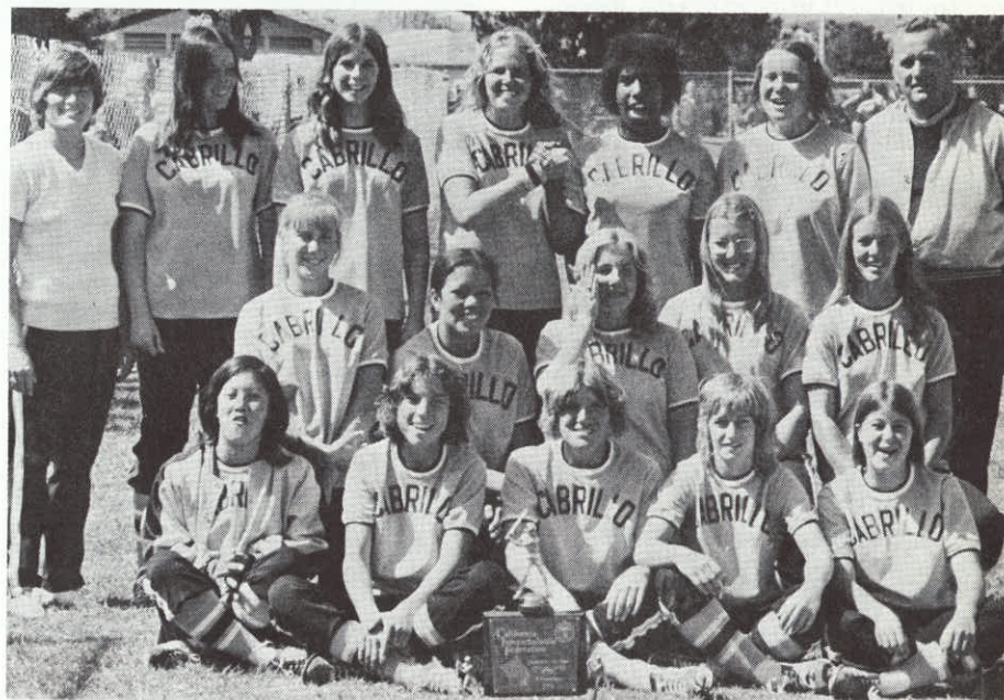
3A titlist Cabrillo celebrates after winning top honors