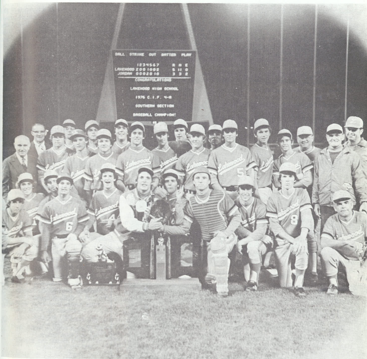
LAKEMOOD HIGH SCHOOL 1976 4A BASEBALL CHAMPION