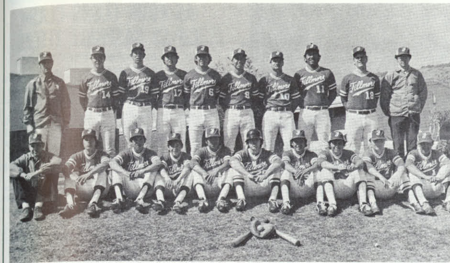
Fillmore H.S. repeats as the titlist in the 1A division

These packets will be available August 25th and will contain copies of the Blue Book, Directory of Member Schools, new informational material and forms for the 1976-77 year.