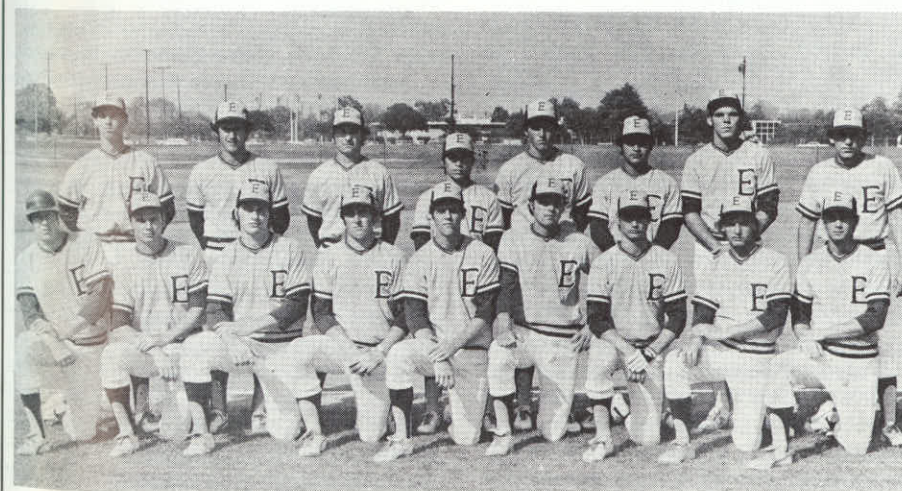
Edgewood H.S. captures CIF-SS 3A baseball championship