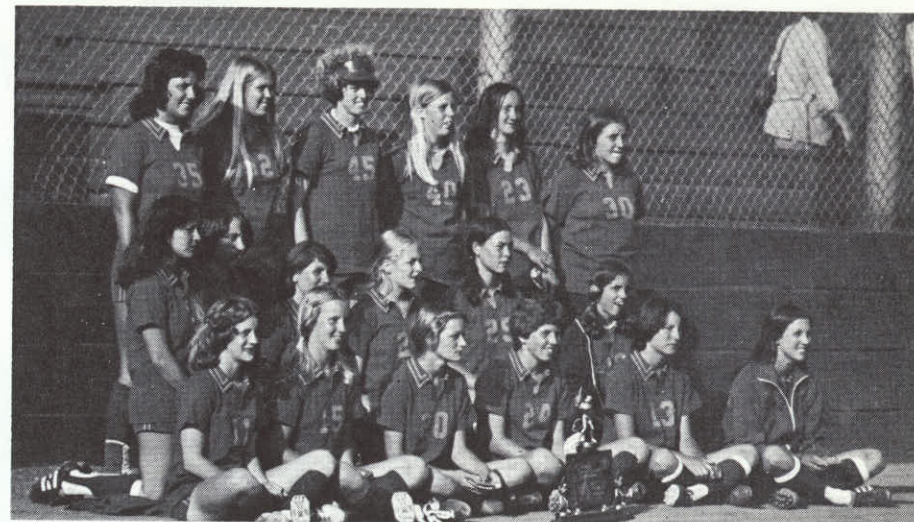
4A champion El Segundo team after winning coveted CIF-SS title