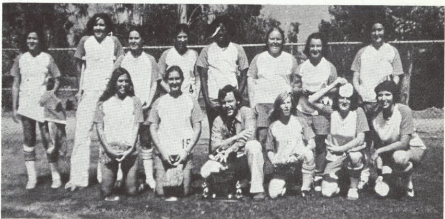
2A champion South Pasadena caps brilliant softball season