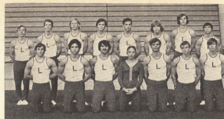
ANOTHER GYM TITLE FOR LAKEWOOD: The 14-man, 1-woman Lancer Gymnastic Squad strike a championship pose after narrow victory over Westminster HS.