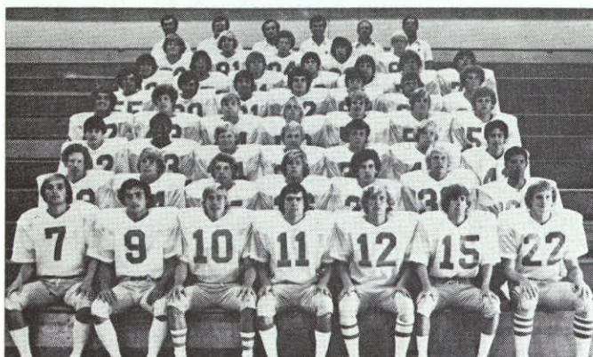
Central — Mission Viejo