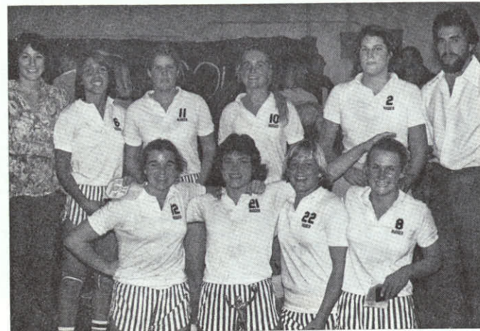
4A — Corona del Mar High School