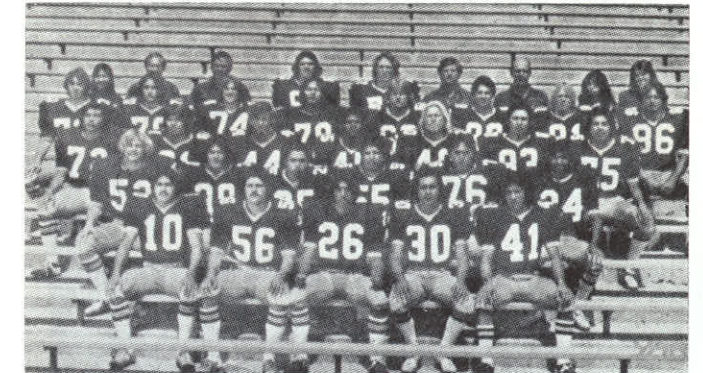
Southeastern — Colton