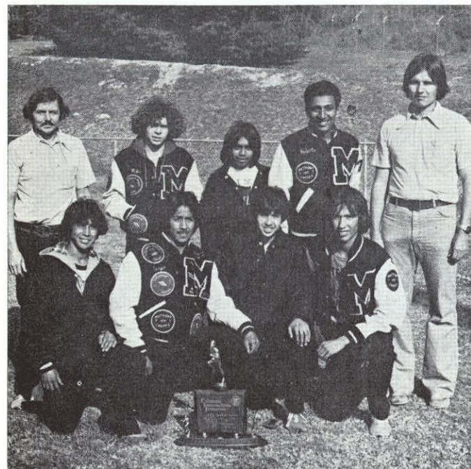
2A — Boys, Montebello High School

Congratulations to them all and for those who will still be competing, good luck in next year's cross country season.