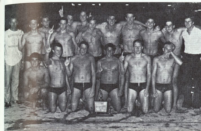
4A Winners — Newport Harbor High School