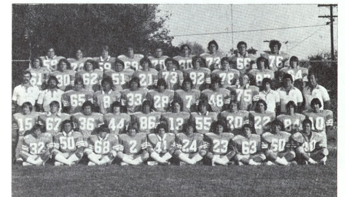
Desert - Mountain — St. Genevieve