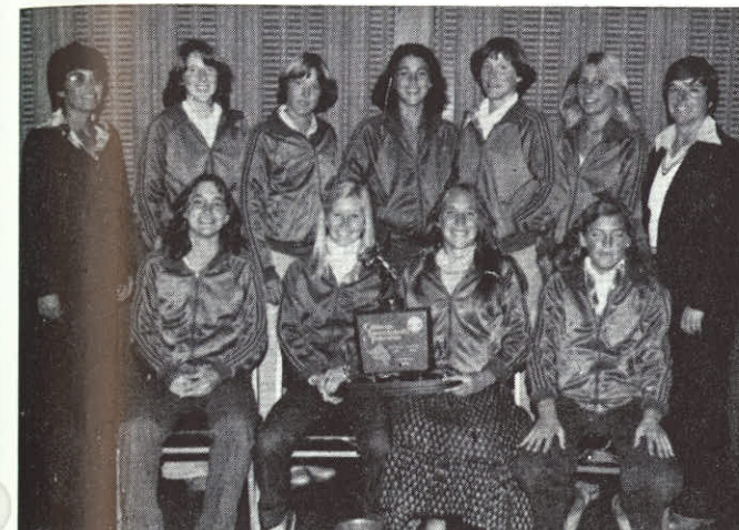
4A — Santa Barbara High School