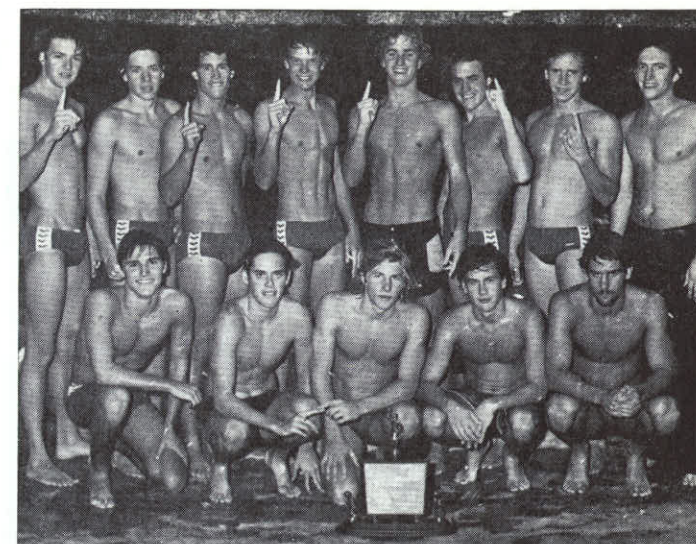
2A Champs — San Marino High School