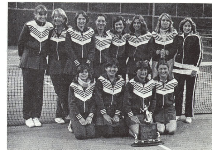
3A — Corona del Mar High School