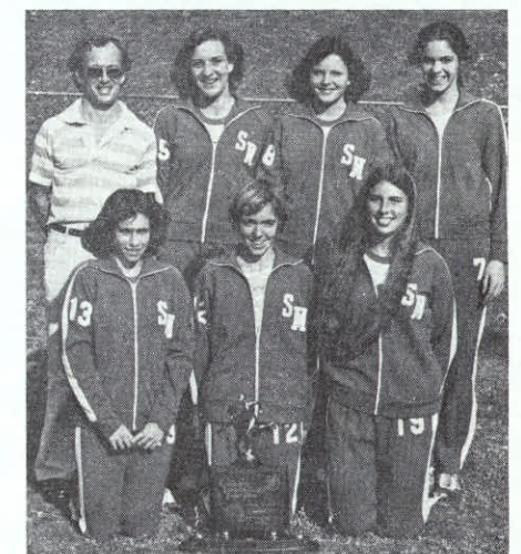
2A — Girls, San Marino High School