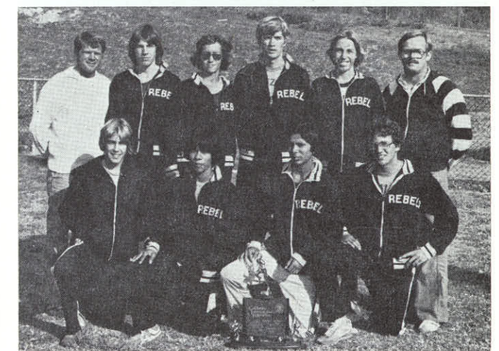
3A — Boys, Quartz Hill High School