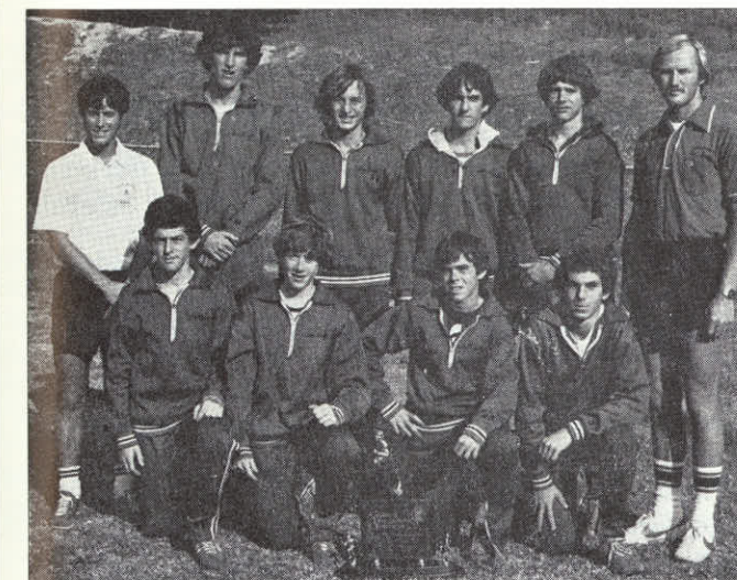
4A — Boys, Palos Verdes High School