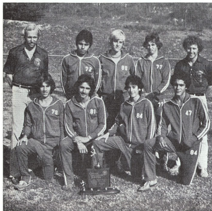
1A — Boys, Alemany High School