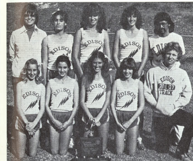
4A — Girls, Edison High School