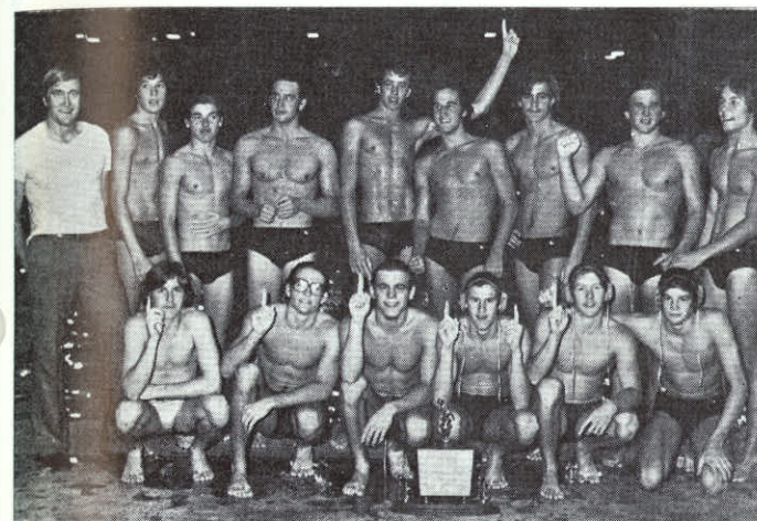
3A Titlist — El Dorado High School