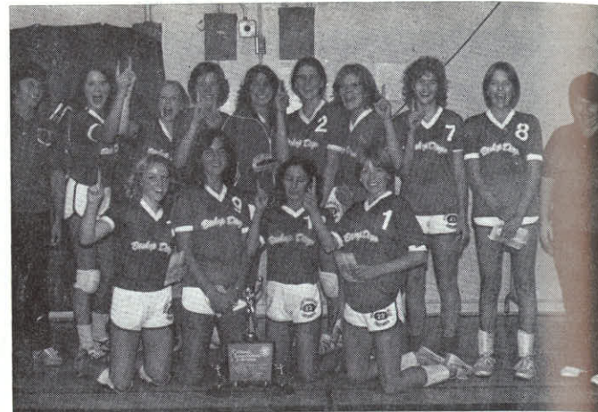
2A — Bishop Diego High School