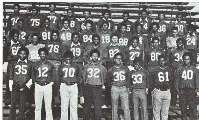
Coastal — Compton