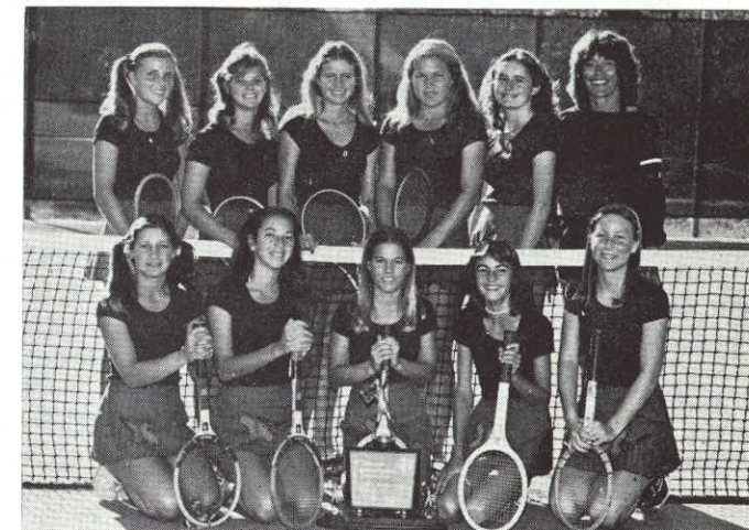
2A — San Clemente High School