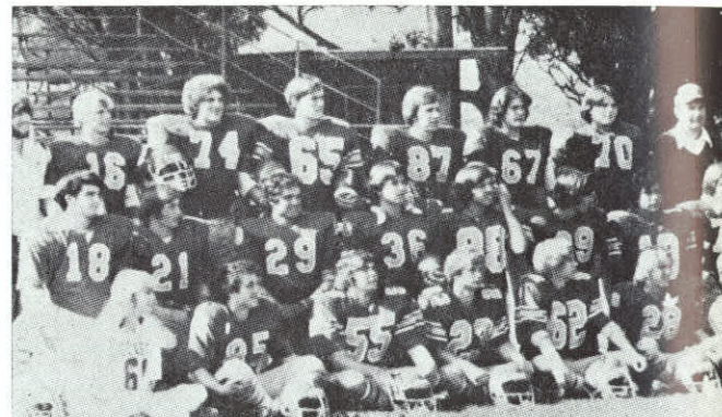
Eight-Man — Coast Union

St. Genevieve 36 and Elsinore 12 was the final score in the Desert-Mountain championship playoff game held the 15th at Ramona High School. St. Genevieve (10-3) is