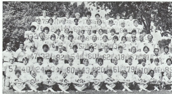
Big Five — Fountain Valley