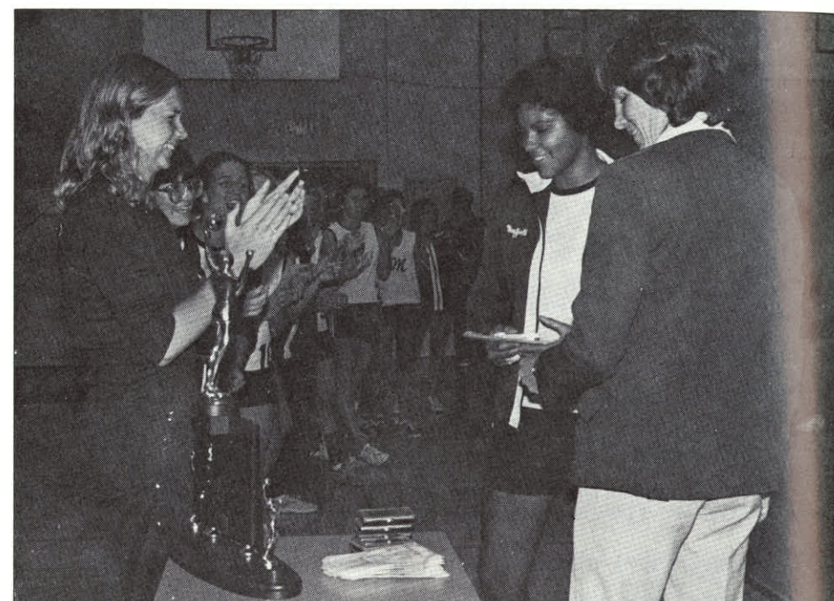
In the CIF-SS Girls' Volleyball Finals at Westminster High School, Mayfield High School, (pictured above) upset Buckley 15-5, 15-9 to take the Small School Division crown.

Mayfield over Lutheran 15-13, 16-14 Buckley over Argyll 15-9, 15-11