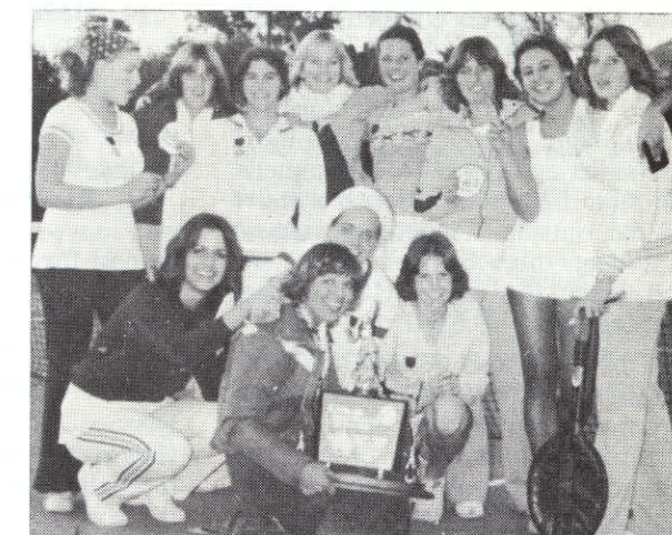
1A — Westlake High School