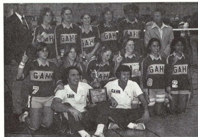
3A — Gahr High School

Other championship results were 3A winner Gahr High School who beat Santa Ana 8-15, 15-2, 15-13; 2A is headed by Bishop Diego who took South Pasadena 10-15, 15-1, 15-10; 1A action put Cajon on top over Inglewood, 12-15, 15-5, 15-6 and Small School competition named Mayfield the champion in an upset over Buckely High School, 15-5, 15-9.