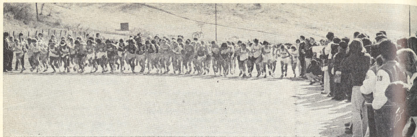
They start en mass at the 1975 CIF-SS cross country championships at Mt. San Antonio College in Walnut