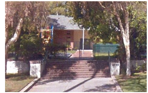
CIF-SS Office - 1945