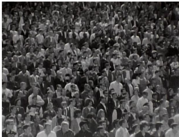
Film clips taken from the 1965 race