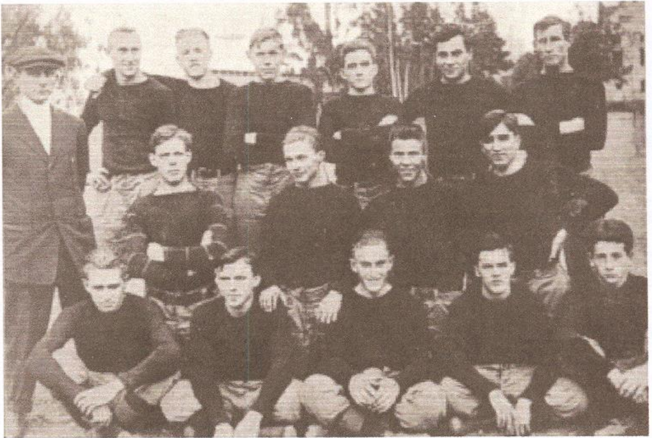
The Chaffey High School 1913-1914 school year football team & coach.