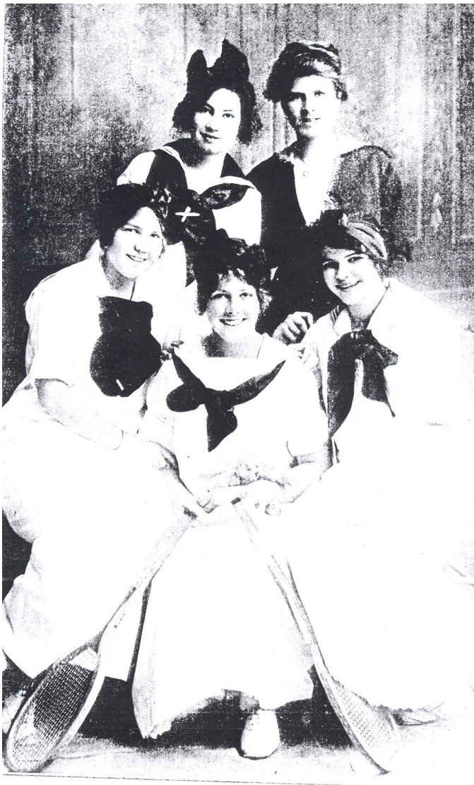
Santa Ana Girls Tennis Team 1914