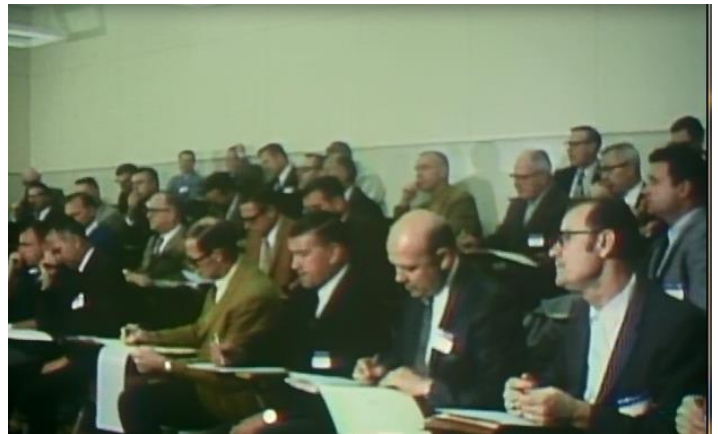
CIF-SS Council Meeting