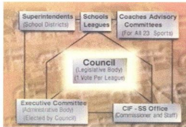
Promo Video cca 1995