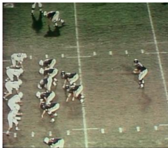
El Rancho-St. Paul Coliseum 1968