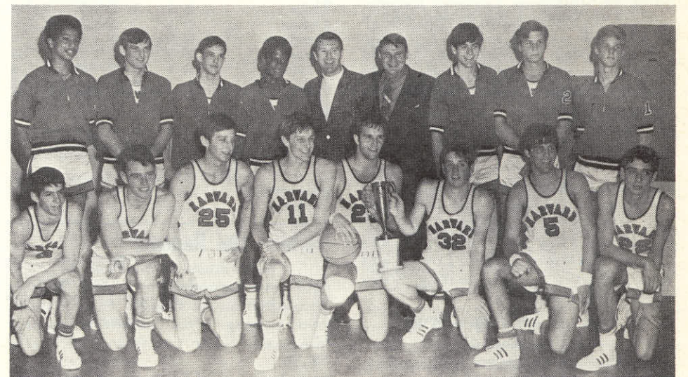
WINNING SMILES — Members of Harvard High's Championship "A" Basketball Team, flash winning smiles after their exciting 54-52 win over Trona.