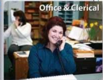
Office & Clerical