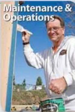
Maintenance & Operations