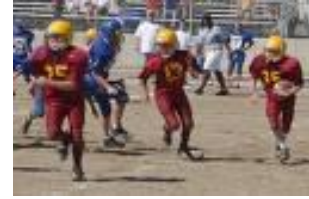
Trona’s sand field... “The Pit”