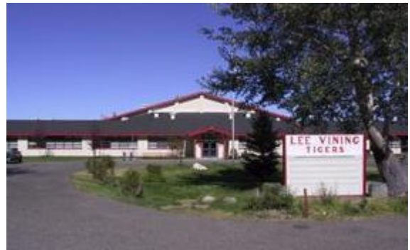
Lee Vining High School