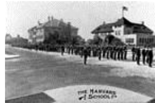
Harvard Private School

No – If the occasion should arise, the request should be made in Writing to the Council.”